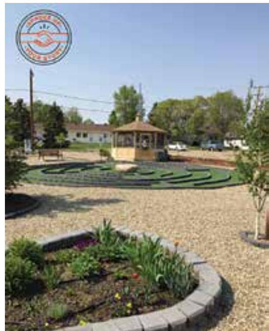
Cabri Community Garden in Cabri, SK was a 2020 Spruce Up Your Story winner.

At Red River Mutual, your story and the stories of your customers is ours to protect. 🏡